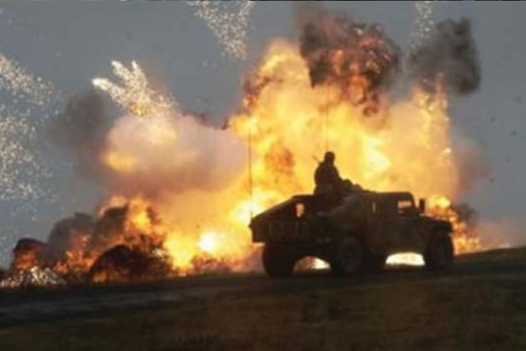
Universal Camouflage (UCP)