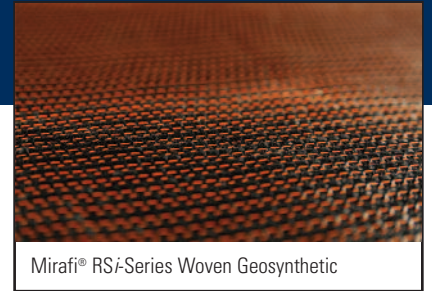
Mirafi® RSi-Series Woven Geosynthetic

Geosynthetic Placement Place the geosynthetic directly on prepared surface. It is advisable to leave vegetative cover such as grass and weeds in place to provide a support matting for construction activities. The geosynthetic should be deployed flat and tight with no wrinkles or folds. The rolls should be oriented as shown on plans to ensure the principal strength direction of the material is placed in the correct orientation. Adjacent rolls should be overlapped or seamed as a function of subgrade strength (CBR). Prior to fill placement, Mirafi® RSi-Series geosynthetics should be held in place using suitable means such as pins, soil, staples or sandbags to limit movement during fill placement.