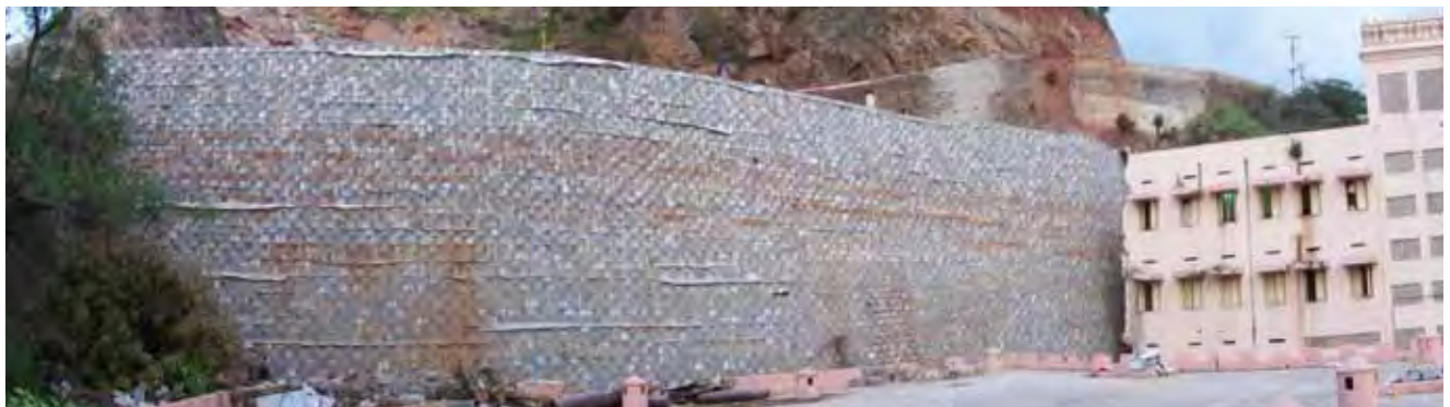
Side view of the segmental wall using Polyfelt® PEC reinforcement.

Polyfelt® is a registered trademark of TenCate.