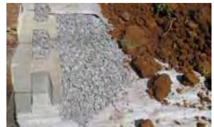
Close up of Polyfelt® PEC and segmental blocks.