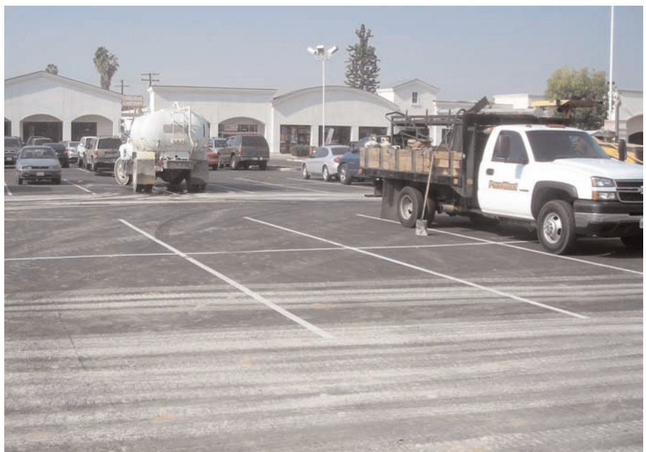
Completed parking lot.

The finished parking lot is at the corner of South Sunset Avenue and Francisquito Avenue in West Covina, CA. The new pavement and fresh white striping completes the Northgate Shopping Center facelift with new store fronts and added businesses. The new design with Mirafi® HP270 provided significant savings in material costs versus the biaxial geogrid and additional savings with a reduction of the base course. The benefits of Mirafi® HP270, high strength, separation and filtration will extend the pavement life keeping up the shopping center appeal for years to come.