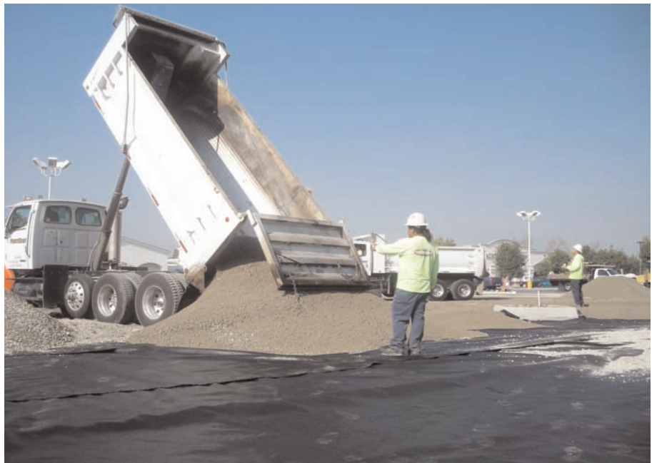
Crushed miscellaneous base placed over Mirafi® HP270.

The distressed parking lot pavement and old subbase were removed to a depth of 8 inches and recycled. Mirafi® HP270 was placed over the prepared subbase using a one foot overlap on roll edges and roll ends. Caltrans Class 2 CMB (crushed miscellaneous base) recycled concrete with stone was placed directly on the Mirafi® HP270 using dump trucks and spread with loaders. The CMB was compacted in a six inch lift using a vibratory roller. A 2-inch thick asphalt pavement was installed over the compacted CMB.