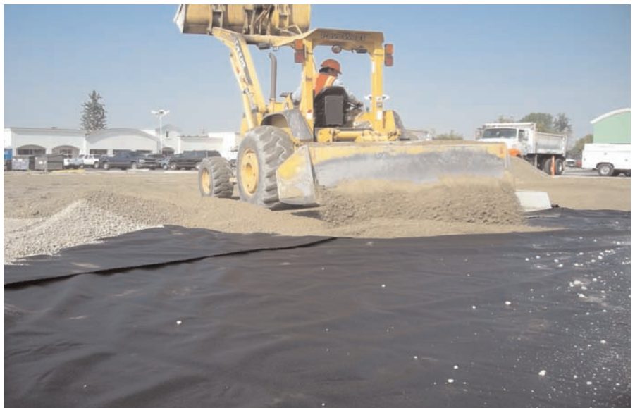
Mirafi® HP270 placed over the subgrade.