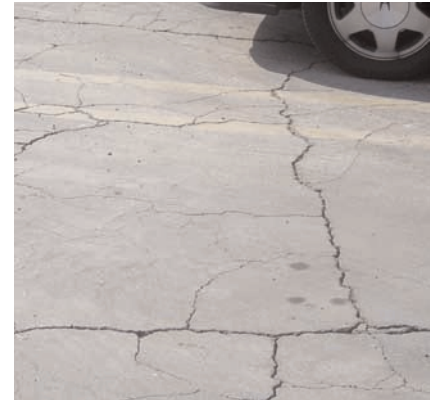
Existing parking lot condition.

the pavement design. The result was the use of Mirafi® HP270 high performance geotextile. Using Mirafi® HP270, the amount of aggregate was reduced by 4", thus eliminating additional excavation of the subgrade and meeting the tight budget set by the owner. As an added benefit, the reduction of the base course produced a total aggregate savings of 44,550 ft³ and a CO² reduction of 44,840 lbs of emissions.