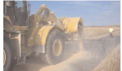
Placing caliche on textile road test section.

The haul road area at the site was stripped of vegetation and then the subgrade was wetted down and rolled 5 times with a smooth drum roller until minimum deformation of the subgrade occurred under loading. Two roll widths of Mirafi® HP270 geotextile were placed for each 20 ft wide road section. Because of high residual water table and the potential for flooding of the site during rain events, a raise in grade was required at some locations. Before installing the geotextile, a sheep's foot roller was used to compact the existing soil and light vegetation, then suitable fill placed where they needed to raise the grade above standing water elevation. After the subgrade was leveled, Mirafi® HP270 geotextile was installed and the caliche was placed, graded and compacted. The required thickness of the caliche depended on the elevation of the water table adjacent to the roadways and whether the soil contained more sand than silt. An approximate 8" aggregate thickness sufficed for most of the project cross sections.