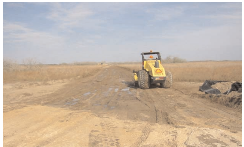
Wet subbase before placing geotextile.