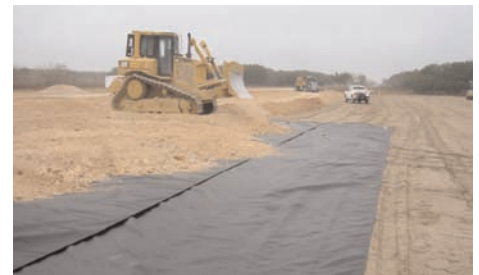
Placing caliche on textile over parking lot.