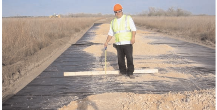
Mirafi® HP270 geotextile shows capsulation of base material in rutting zone.

Proof-rolling tests were performed on the caliche and subgrade both with, and without geotextile stabilization. Upon rolling over the caliche, where a Without geotextile stabilization, deformations of 2-3 inches occurred as shown in the adjoining photos. This deformation would have resulted in the loss of the imported caliche fill, both during initial road construction and long-term. Because of the high water table anticipated at many of the roadway locations, the geotextile stabilization must have very good permittivity, high strength at low strains (high tensile modulus). To meet these requirements, Mirafi® HP270 stabilization geotextile was selected for the project. A biaxial geogrid was also considered for haul road stabilization for the project but was rejected since the geogrid has large openings which would allow the intermixing of soft, wet subgrade soils with the caliche, resulting the degradation of the pavement section.