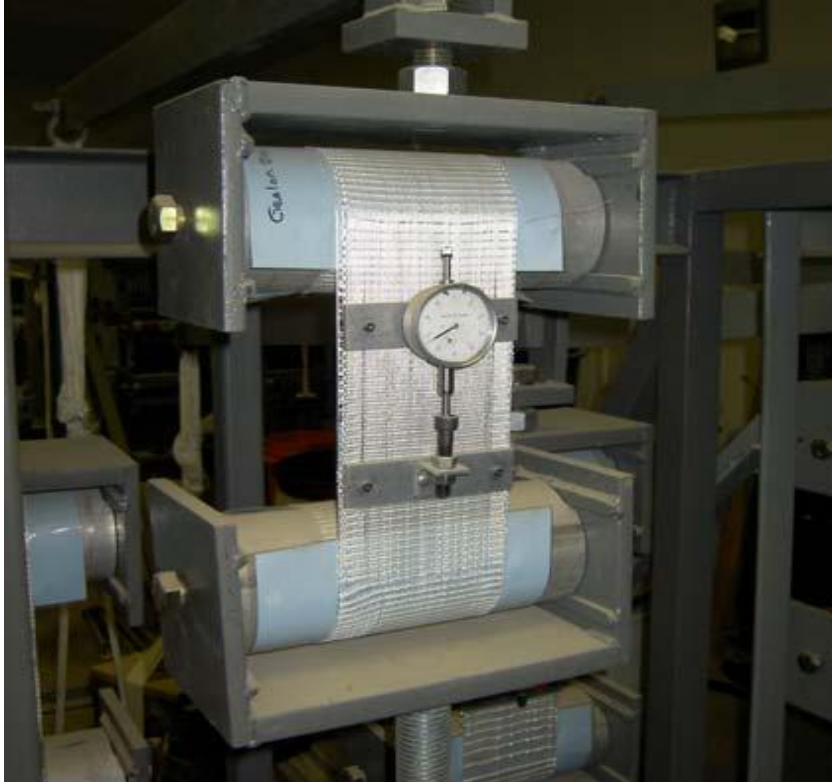
Testing Services and SIM testing performed by TRI/Environmental.

[6]. Creep Reduction Factors for PET-Series geotextiles were determined by conventional creep testing performed by SGI.