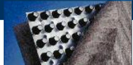
Mirafi® G-Series Drainage Composite

Mirafi® G100N, G200N and G100W drainage composites are designed for use in high-flow, high compressive strength, vertical applications where single or double-sided subsoil drainage filter layer is needed. The flat side of the core fits directly against wall surfaces making it ideal for retaining walls, bridge abutments and other similar retaining structures. Mirafi® G100N, G200N and G100W drainage composites are capable of collecting large quantities of subgrade water and conducting it to a discharge pipe or collection