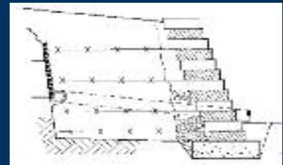
Retaining Wall Interceptor Drain

TenCate® Geosynthetics North America assumes no liability for the accuracy or completeness of this information or for the ultimate use by the purchaser. TenCate® Geosynthetics North America disclaims any and all express, implied, or statutory standards, warranties or guarantees, including without limitation any implied warranty as to merchantability or fitness for a particular purpose or arising from a course of dealing or usage of trade as to any equipment, materials, or information furnished herewith. This document should not be construed as engineering advice.