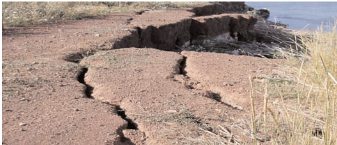
Failed dike and tension cracks on the failing edge.

and a combination of these methods. Hap Taylor, the contractor suggested using light-weight volcanic cinders to mitigate the embankment instability issues and potentially allow embankment construction in a single stage. However, the light-weight fill was highly susceptible to erosion and vulnerable to seismic liquefaction. Embankment stability was improved using a combination of Miragrid® 20XT and Mirafi® HP370. Mirafi® 1160N non-woven geotextile, and riprap provided drainage and erosion protection.