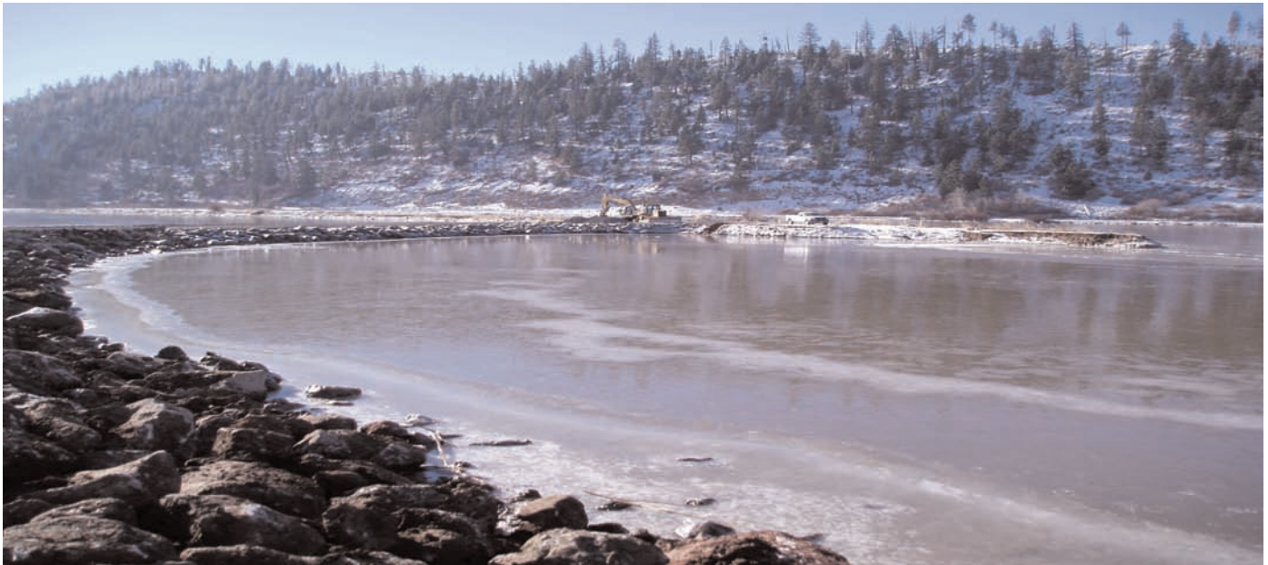
Geary Dike repair, December 28, 2006.

TenCate Geosynthetics North America assumes no liability for the accuracy or completeness of this information or for the ultimate use by the purchaser. TenCate Geosynthetics North America disclaims any and all express, implied, or statutory standards, warranties or guarantees, including without limitation any implied warranty as to merchantability or fitness for a particular purpose or arising from a course of dealing or usage of trade as to any equipment, materials, or information furnished herewith. This document should not be construed as engineering advice.