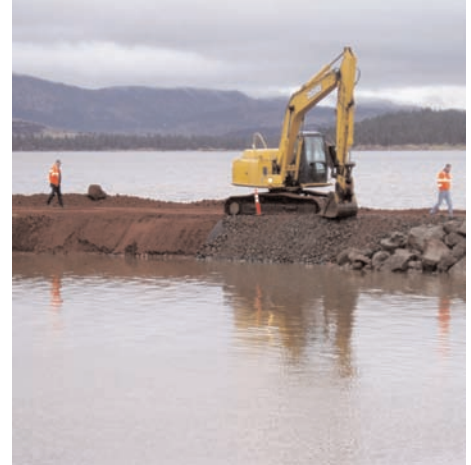
The new dike with the riprap sides.

By placing the embankment sideslopes at the angle of repose, overcame equipment reach limitations and minimized earthfill quantities. Embankment stability was improved using Miragrid® 20XT. Mirafi® 1160N nonwoven geotextile, and riprap provided drainage and erosion protection. Soil improvement by soil mixing, soil grouting, or vibro-compaction was proposed to improve liquefaction resistance. The use of geotextiles for this dike repair was the most constructable and effective permanent solution to a significant problem.