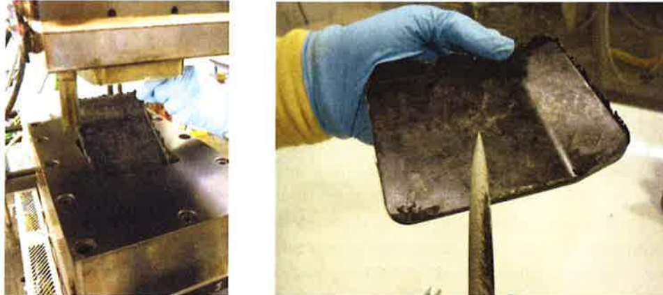
Figure 11. Demolding and deflash.

The part can be removed from the tool when the temperature falls below the Tg of the polymer. There will always be a small amount of flashing that needs to be removed from the part perimeter, but note that the amount of flash is very small compared to the volume of the part. A diamond grit file is well suited to remove the flashing and any fibers (Figure 11).