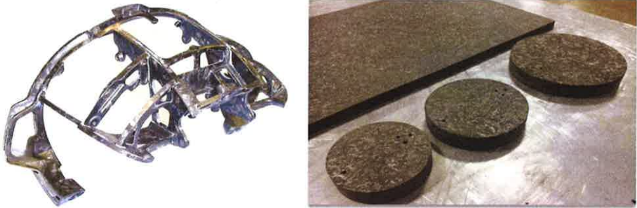
Figure 2. Helmet optical support structure and billet hard-points.

restrictive in geometric complexity. Thermoplastic compression molding allows for very long fibers, on the order of 25.4mm (1 inch) or more, to be integrated into a complex shape. Plus, BMCs offer a fiber content similar to continuous fiber laminated composites. Longer and more fibers provide a much stiffer and stronger material than the shorter/fewer fibers found in injection molding materials. Offering a complex shape with these higher mechanical properties is something that either injection molding or traditional laminated composites fabrication methods can do. For example, the helmet optical support structure shown in Figure 2 is incredibly complex.