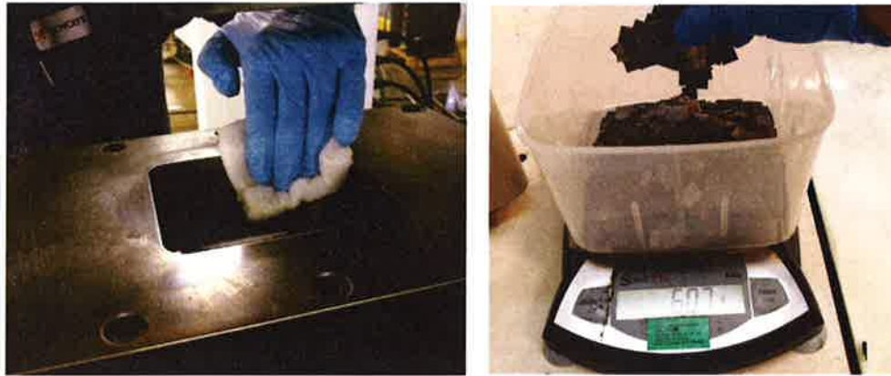
Figure 9. Mold prep and BMC weight setting.

are randomly "sprinkled" into the cavity. The bulk factor of the BMC is in the range of 4 to 8 times that of the consolidated part. Keep this in mind when designing the tooling so that there is enough depth to the mold to hold the compound.