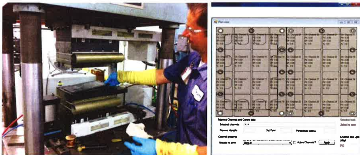
Figure 7. XPress tooling setup and heating zones.

Aside from heating and cooling control, as is common to compression molding, there should be a shear edge on the tool with enough clearance to allow trapped air to transfer out but not the fiber and resin. During forming, the fiber will form a dam at the shear edge that prevents excessive bleeding of the resin out of the tool. Compared to many other thermoplastic compression