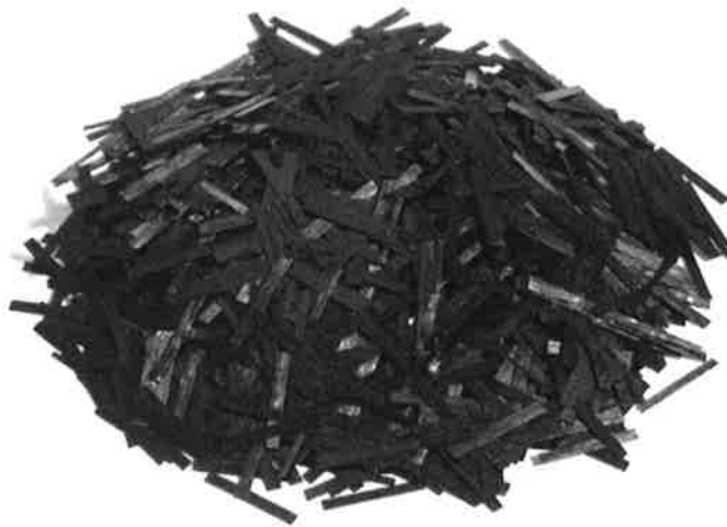
Figure 4. Bulk molding compound.

The bulk molding compounds are in the form of chopped unidirectional prepreg tape. Figure 4 shows a typical sample of carbon fiber BMC. To produce the BMC, TenCate begins with using the Cetex® unidirectional prepreg tape for each of the polymers. The unidirectional tapes are then simply processed through a slitter and cutter that slits the BMC to the desired width and cuts it to the desired length. Fiber lengths range from 6.4mm to 50.8mm (0.25 inch to 2.0 inch). The most common length that gives a good balance between high strength and low material property standard deviation is 25.4mm (1.0 inch). Shorter fibers like 6.3mm (0.25 inch) can be used in parts that have a high degree of intricate detail so that fibers more easily migrate into the features. While the BMC fiber width can be such that the material is a perfect square, or a chip, the more common width is 3.2mm (0.125 inch).