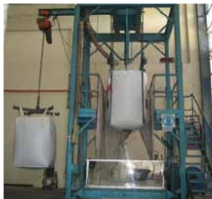
FIBC testing facility