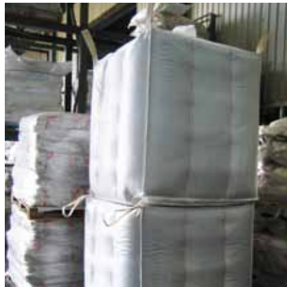
Bulk bags stacked with a forklift