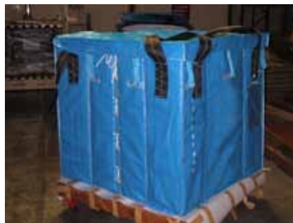
High performance bulk bags