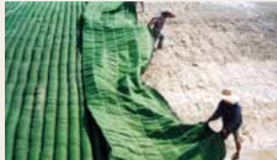
Laying Geotube® Sand Filled Mattress over prepared slope.

The Sand Filled Mattress is delivered in rolls which can be easily transported to site. Laid with parallel tubular sections running down the slope, each are hydraulically filled with sand through the top openings. The sand is introduced through a small hopper and washed down with water pumped from the waterway or impoundment. Adjacent rolls of Sand Filled Mattress are joined by seaming on site. Finally, the Sand Filled Mattress is anchored in a trench at the top of the slope.