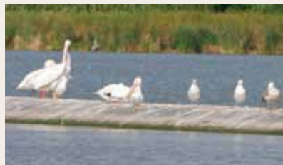
Geotube® Dyke for wetland engineering.

TenCate Geotube® Dyke Systems utilise locally available sand for the construction of dykes in waterways and impoundments. The Dyke Systems either reduce the use of rock or completely replace rock as material for construction of dyke structures. TenCate Geotube® Dyke Systems are ideal for use as river training dykes, reclamation dykes and dykes for water control. They are more economical and often have lower carbon footprints than the rock dykes they replace.