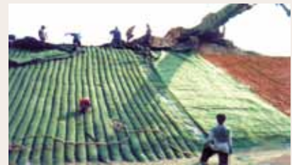
Geotube® Sand Filled Mattress being filled hydraulically with sand.