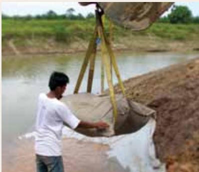
Lifting and positioning Geobag unit.

TenCate Geotube® Geobag units are manufactured from engineered fabrics combined with high capacity seams to produce bag or pillow shaped containers. When filled with sand or other soils, the bags are used as basic armour units for erosion protection works. They are engineered to provide strength, durability and soil tightness to perform during installation and during the operational life. They come in a wide variety of sizes and shapes that can suit practically any site handling conditions. TenCate Geotube® Geobag units are site-filled, closed and placed using standard construction equipment. They are easy to use and can be rapidly mobilised if necessary for emergency works. They are either lifted into position or dropped into water. TenCate Geotube® Geobag Systems are very versatile; they are used to construct revetments and other hydraulic structures, including filling of scour holes and closing of breached dykes.