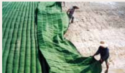
Laying Geotube® Sand Filled Mattress over prepared slope.

The Sand Filled Mattress is delivered in rolls which can be easily transported to site. Laid with parallel tubular sections running down the slope, each are hydraulically filled with sand through the top openings. The sand is introduced through a small hopper and washed down with water pumped from the waterway or impoundment. Adjacent rolls of Sand Filled Mattress are joined by seaming on site. Finally, the Sand Filled Mattress is anchored in a trench at the top of the slope.