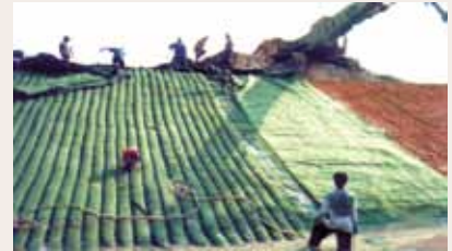
Geotube® Sand Filled Mattress being filled hydraulically with sand.