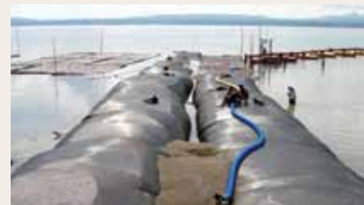
Geotube® Dyke for lakeshore reclamation.