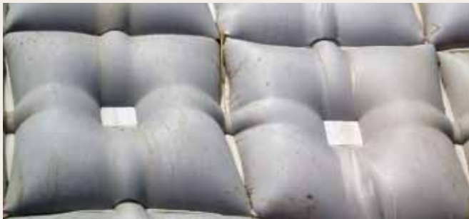
Typical close up of Geotube® Concrete Mattress.

Alternatively, a hybrid system with concrete cellular sections that contain soil and vegetation within the cells can give a softer appeal. TenCate Geotube® Concrete Mattress Systems are economical and can be easily installed at site. They are ideal solutions for areas with poor accessibility and handling of precast concrete units and rip-rap.