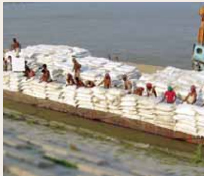
Deploying Geobag units by dropping into water.