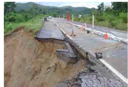
The erosive slip failure at Khun Tan, Lampooon