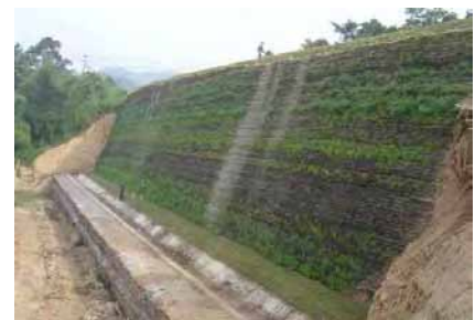
The completed Polyslope B slope with vegetation established

TenCate Miragrid® is a registered trademark of Royal Ten Cate.