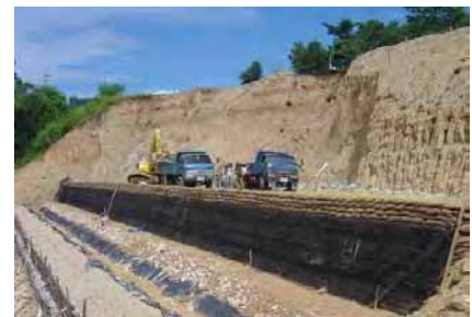
Slope repair works in progress