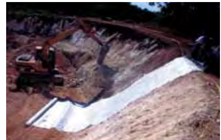
Trimming of the cut slope of laying of Polyfelt® TS.