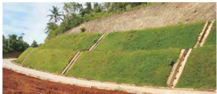
Reinstated slope after 3 months.

Envirocell® is a registered trademark of TenCate.