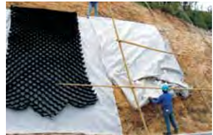
Installation of Envirocell over the Polyfelt® TS.