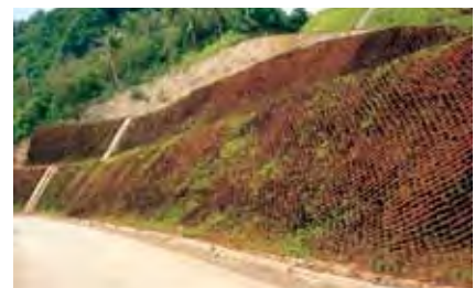
Installed Envirocell with soil backfill.