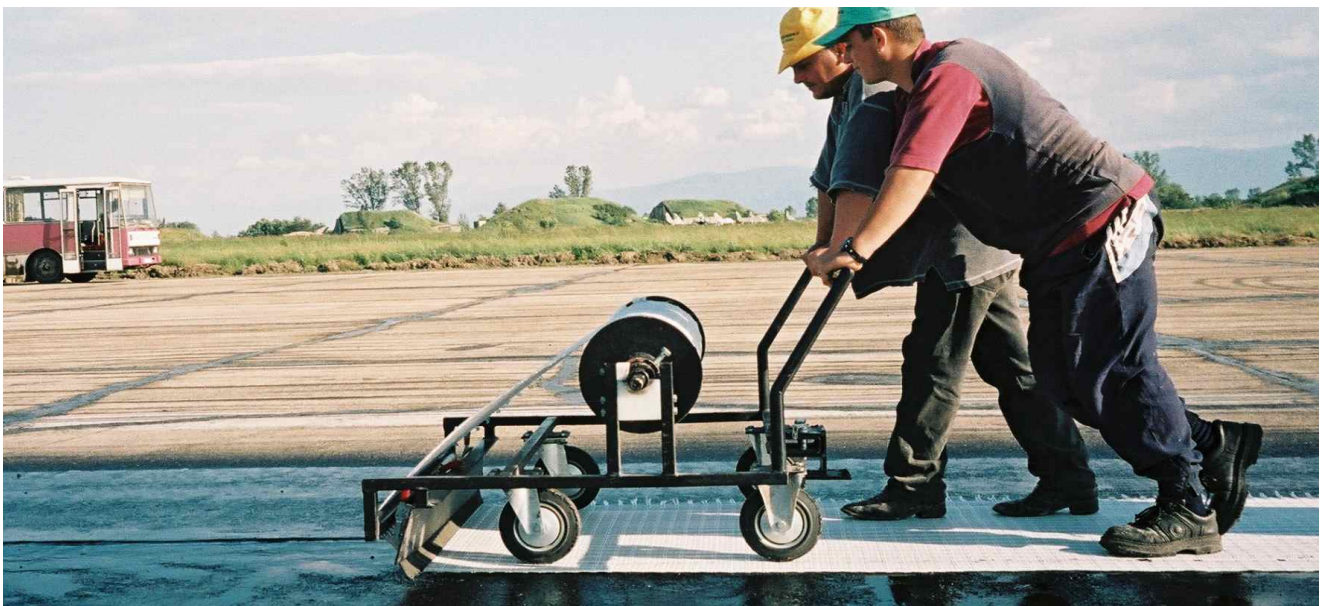
Installation of Polyfelt PGM-G paving fabric with a manual laying machine in top of the tack coat surface.

Polyfelt® is a registered trademark of TenCate.