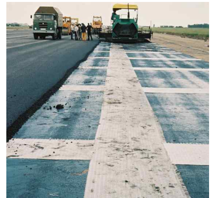
Polyfelt PGM-G strips were placed over the joints of the concrete slabs.