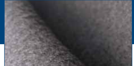
Mirafi® MTK Paving Fabric

Mirafi® MTK paving fabric is a unique, cost-effective waterproofing membrane comprised of a self-adhering, rubberized, asphalt mastic and a geotextile fabric. A convenient peel-n-stick release paper covers the self-adhesive mastic, and is removed prior to installation on both products. Mirafi® MTK paving fabric is made with a non-woven polypropylene geotextile fabric and is appropriate for use over moderate cracks.