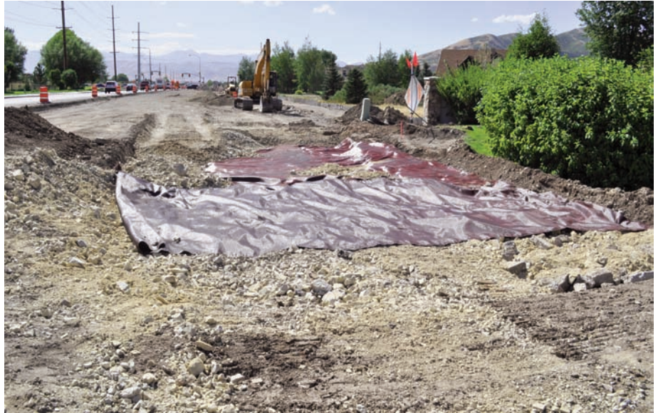
Base material being spread on Mirafi® RS580i.