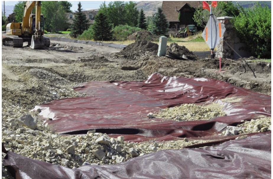
Installation of Mirafi® RS580i on soft soil area.

TenCate™ Geosynthetics North America assumes no liability for the accuracy or completeness of this information or for the ultimate use by the purchaser. TenCate™ Geosynthetics North America disclaims any and all express, implied, or statutory standards, warranties or guarantees, including without limitation any implied warranty as to merchantability or fitness for a particular purpose or arising from a course of dealing or usage of trade as to any equipment, materials, or information furnished herewith. This document should not be construed as engineering advice.