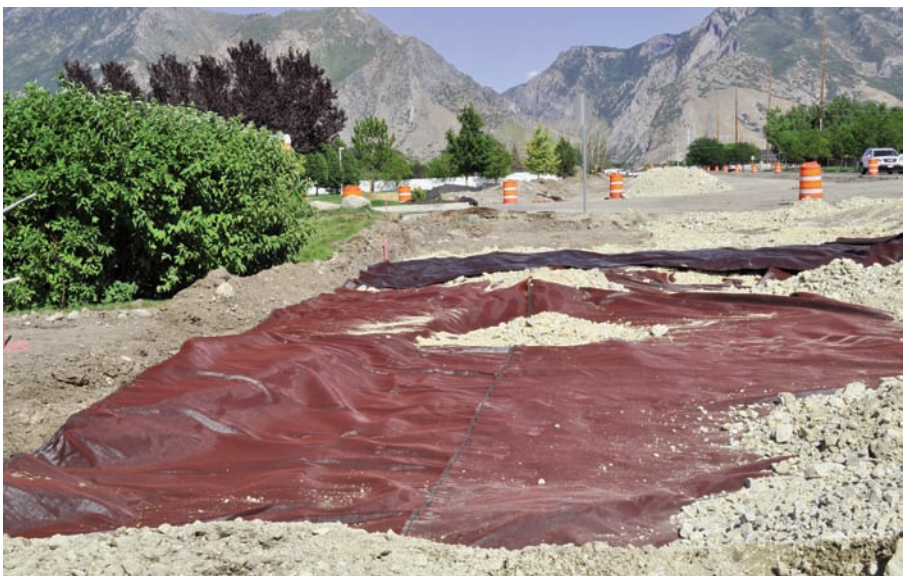
Initial area where Mirafi® RS580i was tested.