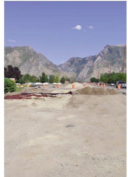
Preparation of subgrade and start of Mirafi® RS580i placement.