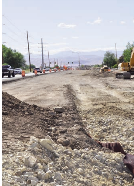
Preparation of subgrade.

The installation consisted of spot stabilization as well as large section stabilization.