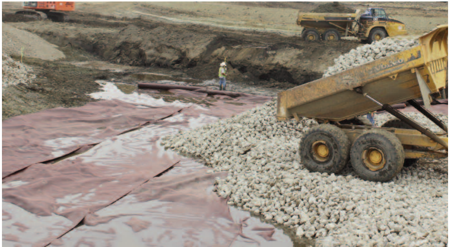
Dump Truck dumps the large/angular crushed concrete onto Mirafi® RS380i.

The result is a completed firm stabilized platform for construction of the 4 commercial buildings & surrounding parking lots & loading docks.