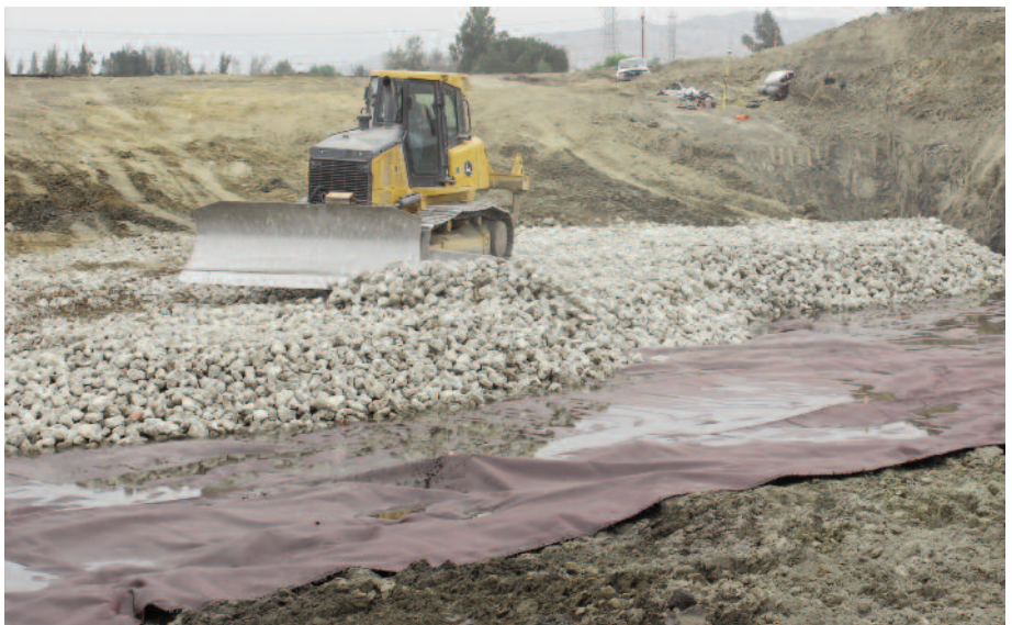
Track Mounted Dozer spreads the crushed concrete over Mirafi® RS380i.

TenCate® Geosynthetics Americas assumes no liability for the accuracy or completeness of this information or for the ultimate use by the purchaser. TenCate® Geosynthetics Americas disclaims any and all express, implied, or statutory standards, warranties or guarantees, including without limitation any implied warranty as to merchantability or fitness for a particular purpose or arising from a course of dealing or usage of trade as to any equipment, materials, or information furnished herewith. This document should not be construed as engineering advice.