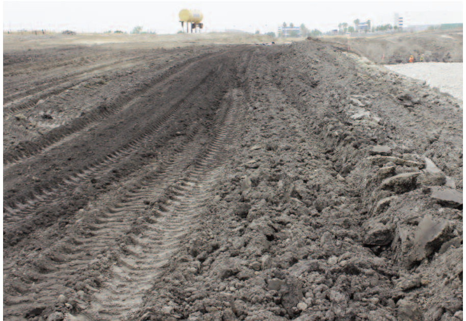
Native alluvial & organic soils covered a large area of the project site

In the areas of the former detention basins, very moist to wet soils were anticipated to be encountered at the base of the recommended over-excavation. SCG provided preliminary recommendations in the soils report for subgrade stabilization. SCG recommended stabilization through placement of a highly permeable, high modulus geotextile fabric (TenCate Mirafi® RS380i*) and a minimum 18-inch thick layer of crushed stone (2 to 4 inch particle size).