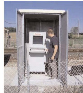
First measurements yield satisfactory results.

TenCate Geosynthetics assumes no liability for the accuracy or completeness of this information or for the ultimate use by the purchaser. TenCate Geosynthetics disclaims any and all express, implied, or statutory standards, warranties or guarantees, including without limitation any implied warranty as to merchantability or fitness for a particular purpose or arising from a course of dealing or usage of trade as to any equipment, materials, or information furnished herewith. This document should not be construed as engineering advice