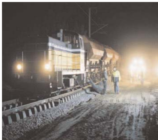
Installation of the TenCate GeoDetect® and ballast layers.

In order to minimize impediment to traffic, all work was carried out in just one single night between 23:00 and 6:00 o'clock. In this short time span, the top layers were removed, TenCate GeoDetect® installed, and both base course and ballast re-installed again. As scheduled, the line was re-opened to traffic at 7:00 o'clock. Despite the difficult conditions (darkness, lack of space, bad weather) the tight time schedule was achieved. This was only possible because TenCate GeoDetect® had been equipped with all necessary cables and connections in advance in the factory. Since 2004, measurements have proven the system fulfills all requirements in full.