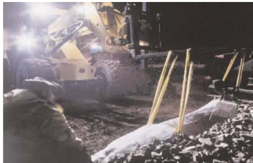
Installation of the TenCate GeoDetect® roll.