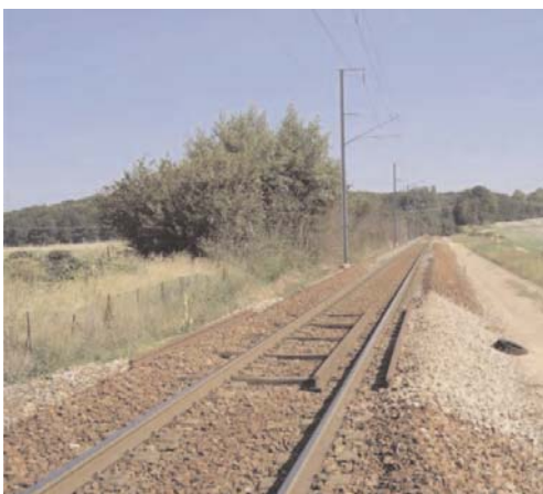
Overall view of the refurbished and reinforced railway section.

The design of the geosynthetic was carried out using the analysis method derived from the RAFAEL project. In the present case, an ultimate tensile strength of 300 kN/m was required. This project is the first practical realization of the RAFAEL research project on the use of high-strength geosynthetics for base courses over cavities, and TenCate GeoDetect®, the first intelligent" geosynthetic. The configuration of the sensors assumed a cavity diameter of 1.2 m. The design led to a sensor spacing of 850 mm, both between the longitudinal optical lines and the sensors along each line. This resulted in a total of 300 sensors within the whole section to be monitored.