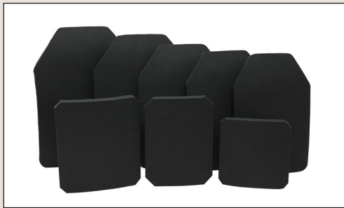
Pictured with Cordura w/ Welded Seams