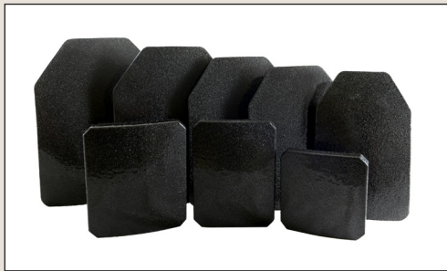
Pictured with Polyurea Cover

TenCate Advanced Armor engineers and manufactures a complete line of hard body armor products that meet or exceeds U.S. Military and National Institute of Justice (NIJ) performance standards. The TenCate Cratus™ brand originated from Greek mythology, personifying strength, might, power and sovereign rule. Our advantage lies in our ability to design products that provide protection against a wide array of threats with the need for reduced weight at the greatest value.