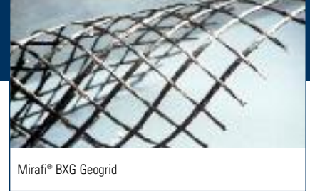
Mirafi® BXG Geogrid

Prepare the ground by removing stumps, boulders, etc. and fill in low spots. Unroll the Mirafi® BXG geogrids directly over the ground to be stabilized. If more than one roll width is required, overlap rolls. Place the aggregate onto previously installed geogrid.