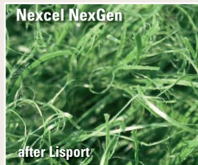
Durability of tape yarn